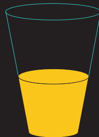
Extracted Energy 100% of all there is

Absolutely NOTHING!! Once ALL the available orange juice (real-time energy) is GONE, that's it!!